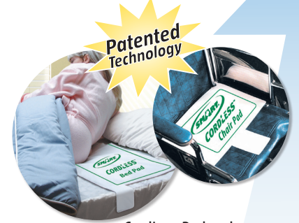
CordLess Bed and Chair Sensor Pads