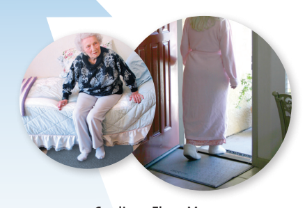
CordLess Floor Mats